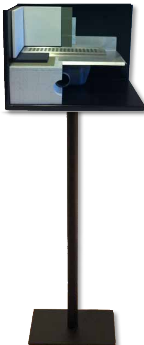
ClassicLine stand without sign

Product number: 257 Dimensions: H: 161 x W: 44 x D: 23 cm