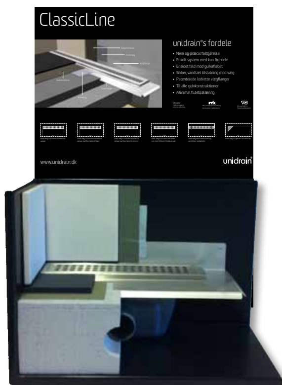
ClassicLine display, incl. sign

The unidrain® display HighLine is a design display that shows some of HighLine's many possibilities with and without the frame.