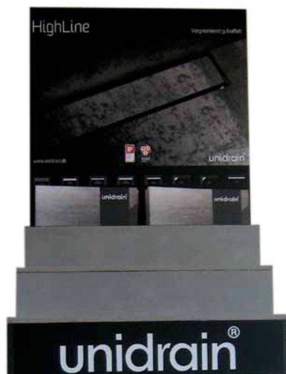
HighLine display, incl. sign

Product number: 254 Dimensions: H: 65 x W: 44 x D: 23 cm