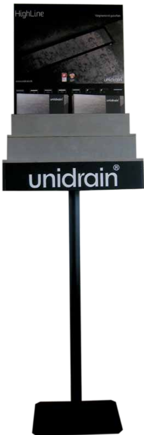
HighLine stand with sign

The unidrain® display HighLine is a design display mounted on an elegant and impressive stand. It shows some of HighLine's many possibilities with and without the frame.