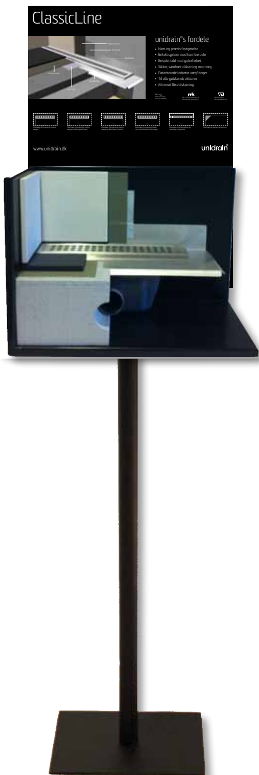
ClassicLine stand with sign

The unidrain® display ClassicLine is a technical display mounted on an elegant and impressive stand. It shows the built-in principle with unidrain® in a concrete construction.